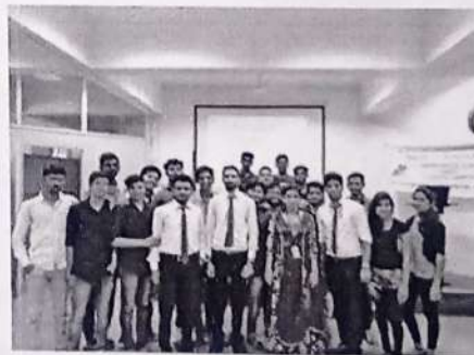
Vote of thanks and conclusion