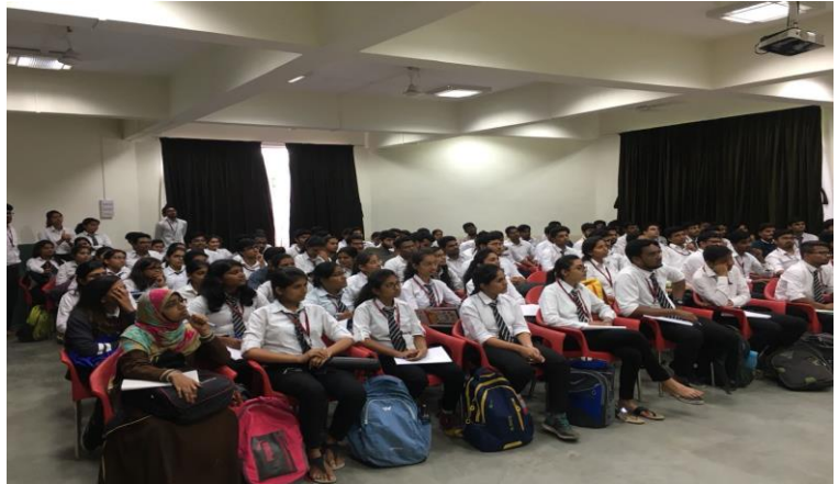
Students Present for the lecture